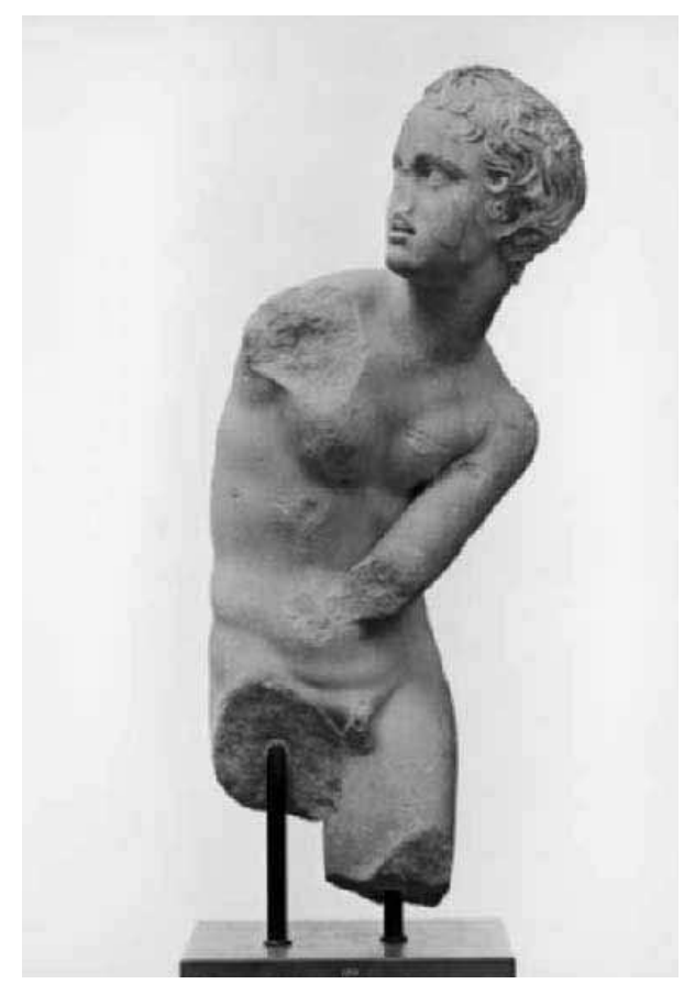
Fig. 5 Eros with bow. 2nd century AD copy of Greek original of 4th century BC. Ny Carlsberg Glyptotek IN 488.

The type of the girl holding an animal is indeed known from grave reliefs, but the statuettes of this type are generally considered to be votive offerings. These types of statuettes – dating from the late Classical to the early Hellenistic period – have been found in sanctuaries all over Attica, and much further afield.<sup>27</sup> A similar figure is for instance a girl from Delphi,<sup>28</sup> and there are further examples from Agrai and Turkey.<sup>29</sup>