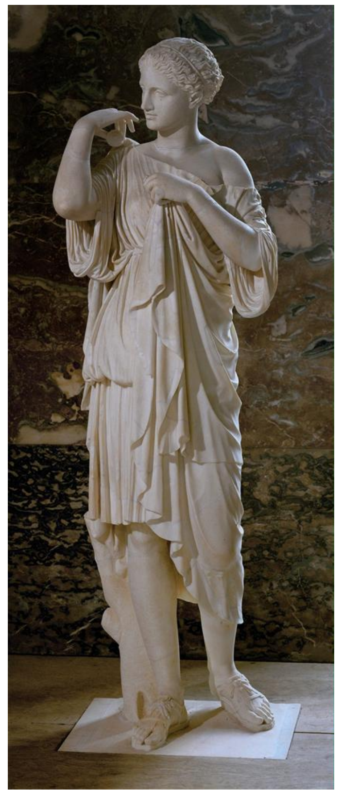
Figure 6: Artemis Fastening her Mantle (Diana of Gabii), Roman copy of Greek original, att. to the sculptor Praxiteles, c. 350 BCE. Marble. Collection of the Musee de Louvre.