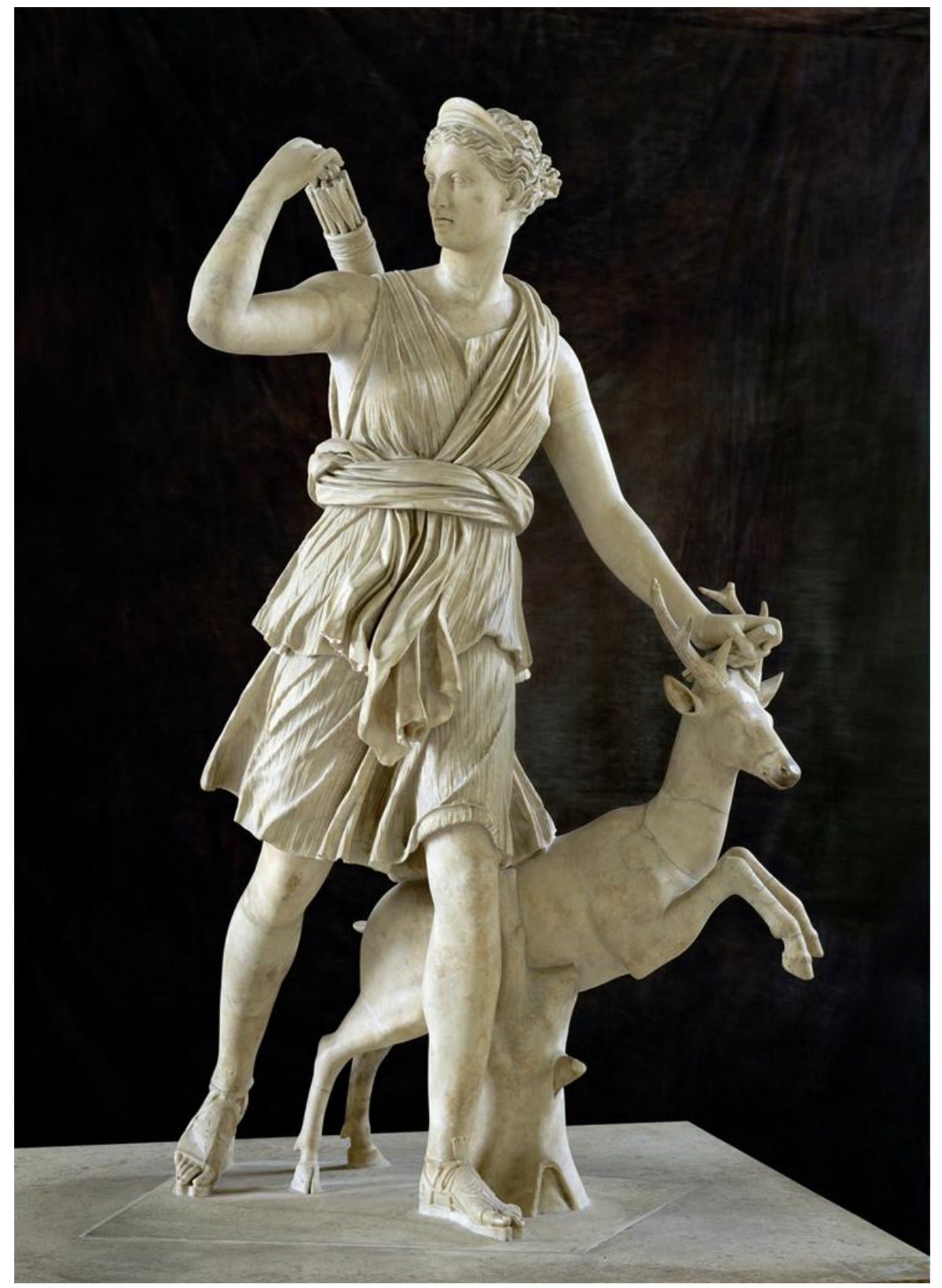
Figure 1: Artemis with a Doe (Diana of Versailles), Roman copy of Greek Bronze original, att. to the sculptor Leochares, late 4<sup>th</sup> century BCE. Marble. Collection of the Musee de Louvre.