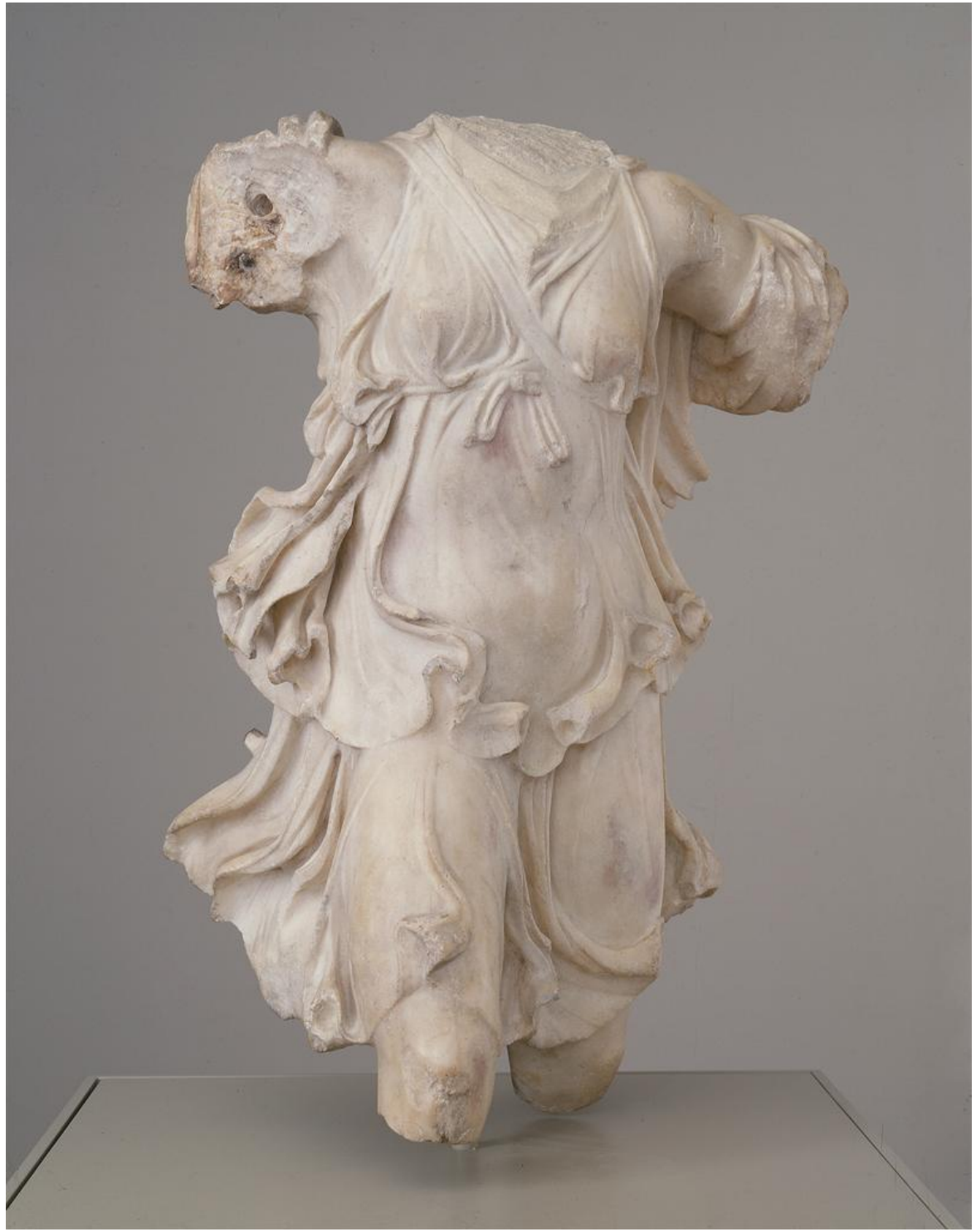
Figure 5: Running Artemis, Greek, late 2<sup>nd</sup> century BCE – early 1<sup>st</sup> century AD. Marble. Collection of the Saint Louis Art Museum.