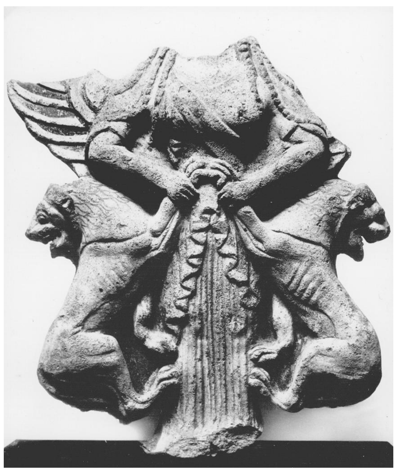
Figure 2: Antefix, Archaic Greek, relief, painted with red and black, ca. 6<sup>th</sup> century BCE. Terracotta. Collection of the British Museum.