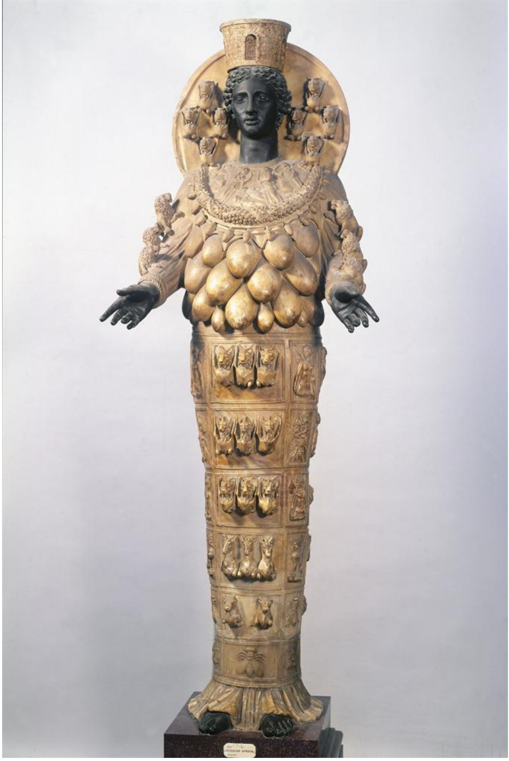
Figure 3: Artemis Ephesia, Roman copy of Greek Original, c. 300 BCE. Bronze, alabaster. Collection of the Museo Archeologico Nazionale di Napoli.