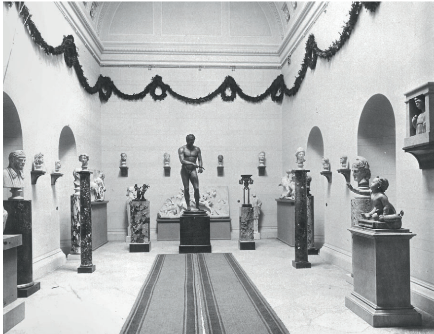
Fig. 6. Exhibition of finds from Ephesos in the "Theseus Tempel" in Vienna, 1901.

Kunsthistorisches Museum in the 1880ies, the temporary exhibition of the first finds from the new excavation abroad was on display in this temple and was received with high interest (fig. 6).