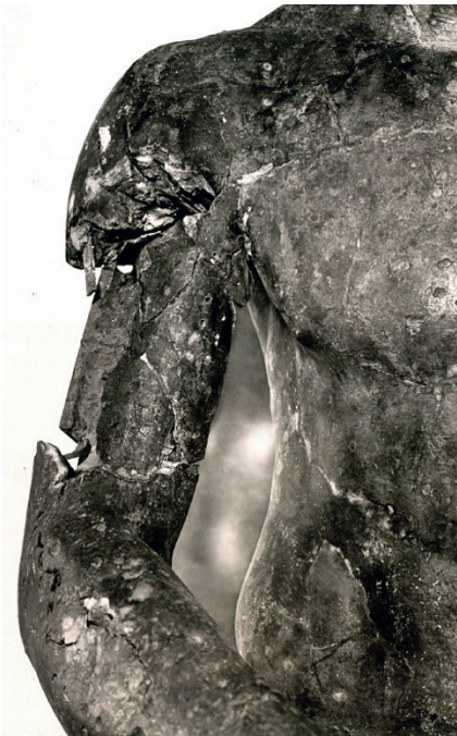
Fig. 7. Right shoulder of the Viennese athlete before correction in 1953.

of the bronze statue from Ephesos. So the right arm remained mounted in a quite disturbing and – finally – wrong angle to the body (fig. 7).