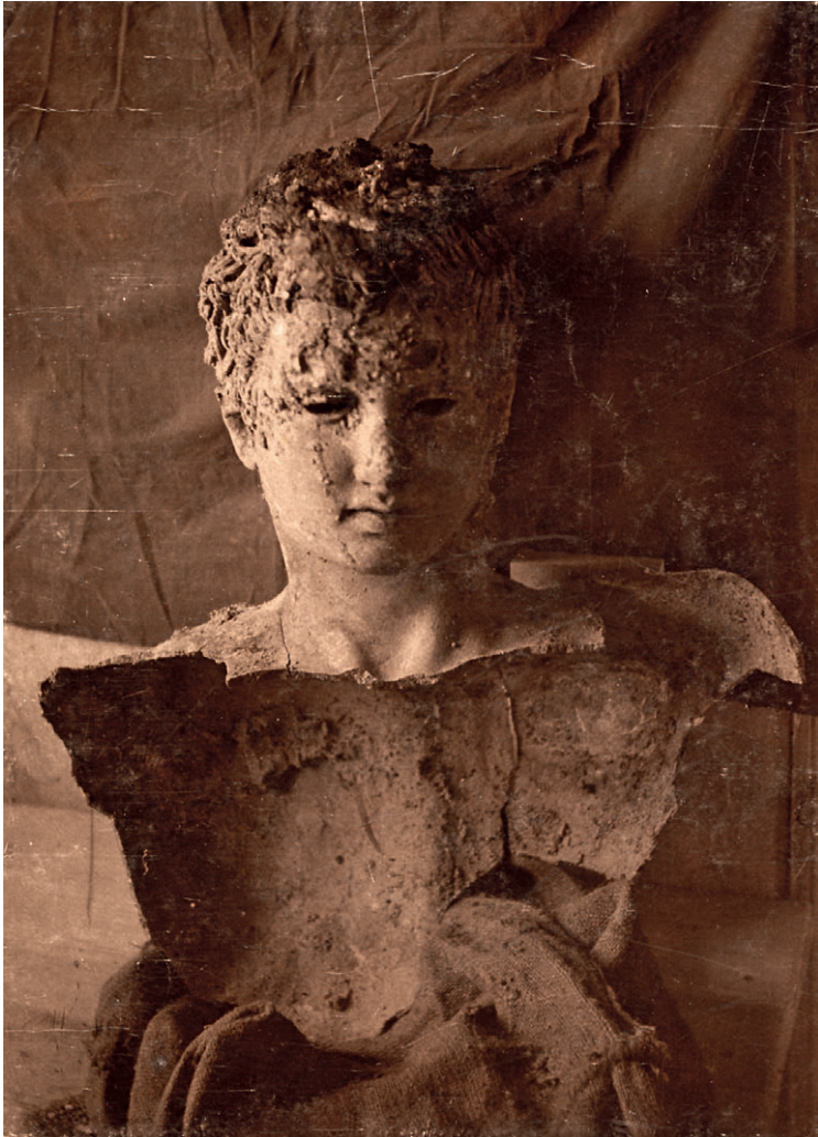
Fig. 4. The Athlete from Ephesos, head and shoulders before restoration.

Once restored, the statue went immediately on display in the first exhibition of "Fundstücke aus Ephesos" in the Theseus Temple in Vienna 9 . This temple is a reduced copy of the "Theseion" (Hephaistieion) in Athens, built by Pietro di Nobile in Vienna, in the years 1819-1823, to house the famous sculpture Theseus fighting the Minotaur from Antonio Canova. After transferring this sculpture to the main staircase of the