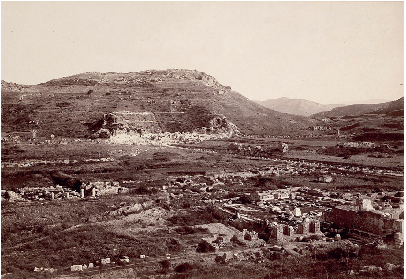
Fig. 2. Ephesos, Harbour Baths around 1900, seen from north-east, in the background the Great Theatre.