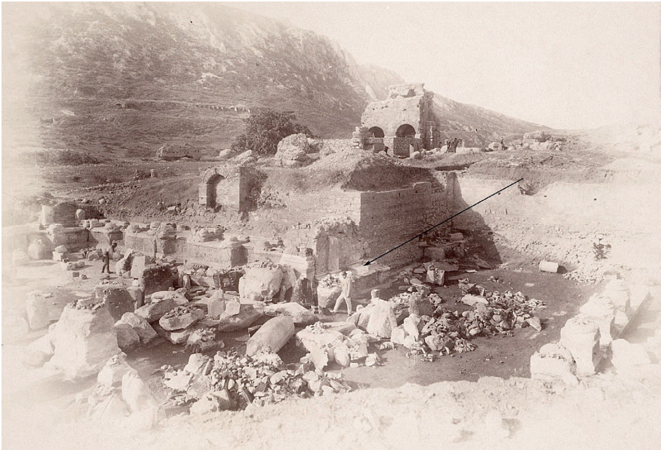
Fig. 9. Ephesos, Harbour Baths: excavations 1896-1897 in the south-west-corner of the palaestra. (marked, the base of the athlete in situ).