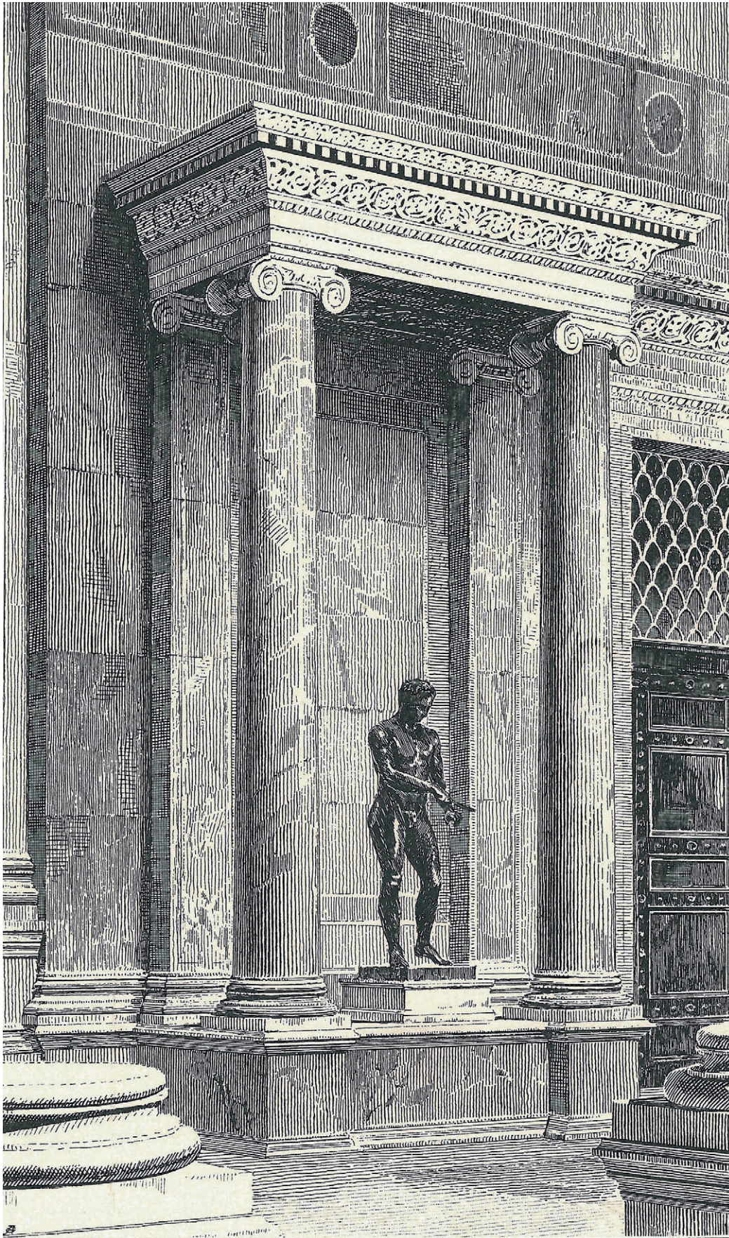
Fig. 11. Reconstruction of original position of the Athlete. © After Benndorf 1906, p. 185 fig. 131.