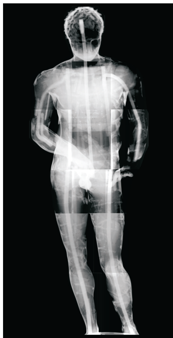
Fig. 12. X-ray-research at the Bundesanstalt für Materialforschung und –prüfung (BAM) Berlin in 2002.

So, the focus of investigation was brought back to the ancient techniques of bronze casting and mounting the single elements as well as to art historical discussion. The possibility to see both Apoxyomenoi from Ephesos and Croatia side by side provided a new impact in understanding the style and iconography of these most famous sculptures. The focus of an ongoing research project in cooperation with the Getty Museum will be a review of the dating of the Greek original as well as of the Roman copies; furthermore it involves a comprehensive discussion of the “mechanisms of original and copy” in ancient Greek and Roman sculpture.