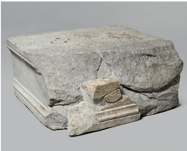
Fig. 10. Base found in the palaestra in Ephesos, marble, H. 30 cm, late 1st century A.D., Kunsthistorisches Museum Vienna, Collection of Greek and Roman Antiquities, inv. no. III 1087.