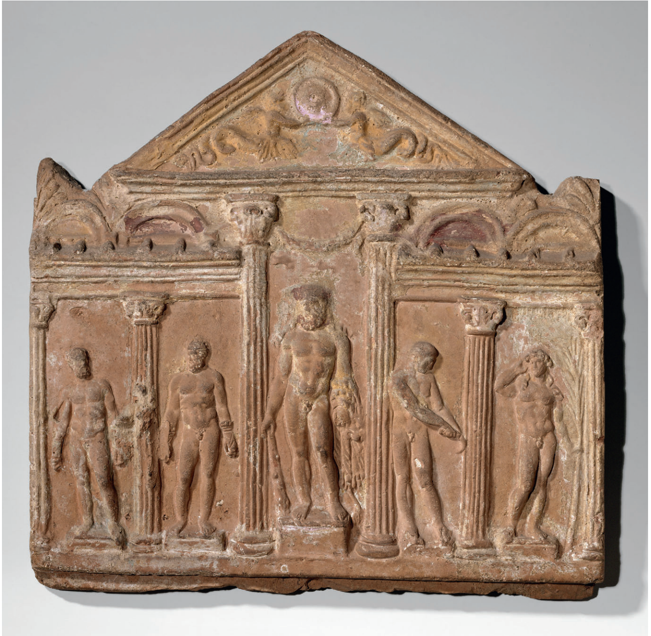
Fig. 8. Campana relief in Vienna showing statues in a palaestra, clay, H. 40 cm, early 1st century A.D., Kunsthistorisches Museum Vienna, Collection of Greek and Roman Antiquities, inv. no. V 1895.