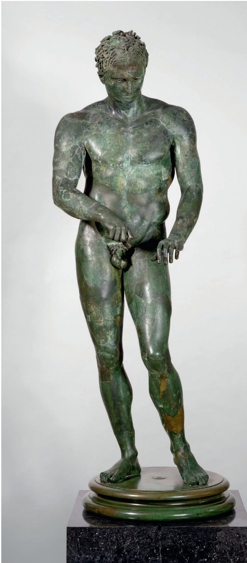
Fig. 1. Ephesian Athlete, bronze, H. 192 cm, second half of 1st cent. A.D., Kunsthistorisches Museum Vienna, Collection of Greek and Roman Antiquities, inv. no. VI 3168.